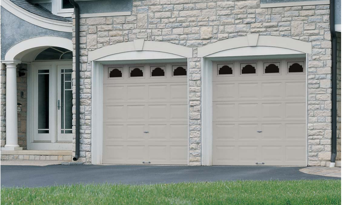
Model 8100 shown in Colonial design with Cathedral I window inserts.